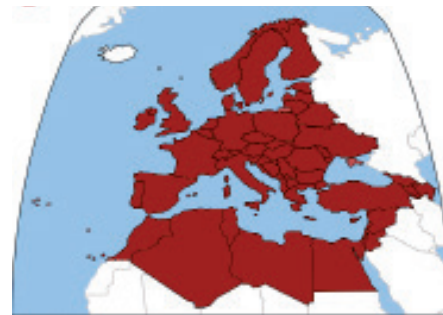
Distribution of Cx. pipiens - 2017 / MosKeyTool

Distribution around the Mediterranean Basin / Native to Africa, this mosquito is now the most widely distributed mosquito in temperate regions, spread mostly by humans to every continent except Antarctica. The pipiens form is probably the only biological form in the most northern part of Europe, and the molestus form more common in the Mediterranean basin.